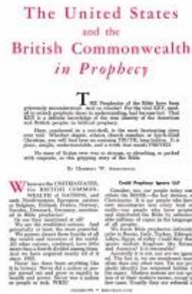
Cover for the 1954 edition

Around 1985 the Worldwide Church of God issued a one page history of the various editions of the book: