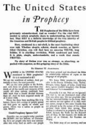
Cover for the 1940 edition

NB: the Ambassador College Bible Correspondence Course , Lesson 16, "Ancient Israel - "Why God's Chosen People"? 1982 was also on this subject. The above are located online at this link .